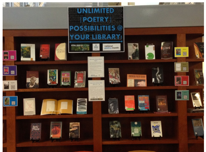
Poetry Exhibit in the Learning Commons

Visit the Diehn Composers Room website (www.odu.edu/library/diehn ) to explore all of its available resources and services.