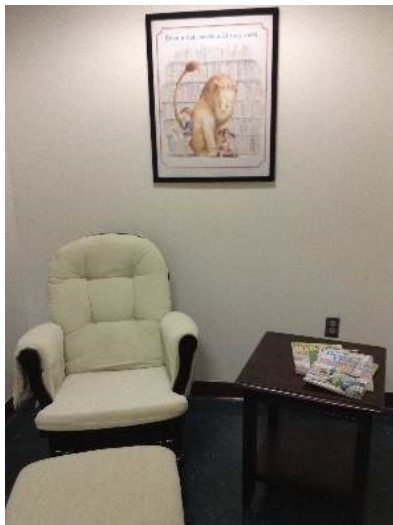
Lactation room in Perry Library

To help meet the needs of nursing mothers at the University, Old Dominion recently adopted a new policy regarding establishment of lactation rooms on its main campus and higher education centers.