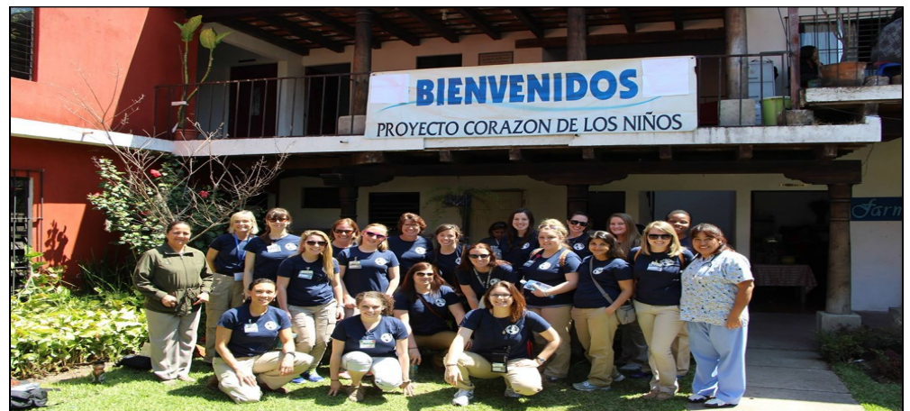
The team poses in front of the banner in Guatemala.