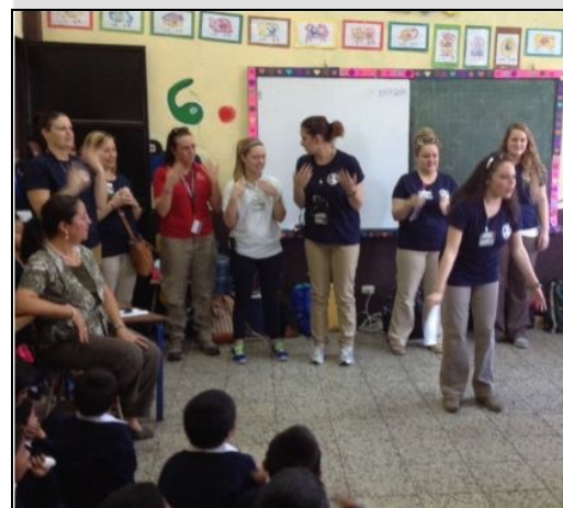
Study abroad students demonstrate the importance of global health.