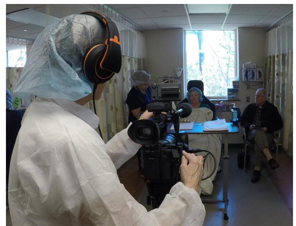
The Ophthalmic Medical Technology Program, from the School of Medical Diagnostic & Translational Sciences, recently took part in a video project.