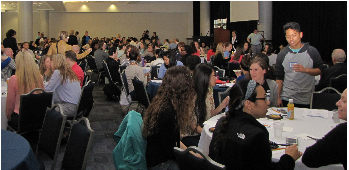
Faculty, staff, students and guests gather in the Big Blue Room at the Ted Constant Convocation Center on April 3 for IPE Day.