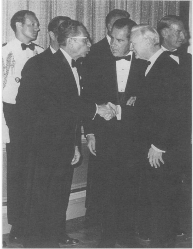
Harry F. Byrd, Jr., Papers (#10,320a-b), Special Collections Department, Manuscripts Division, University of Virginia Library

Richard Nixon ignored Republican nominee Ray Garland and instead made known his preference for Harry Byrd in Virginia's Senate race. In one of several high-profile appearances, Byrd was Nixon's guest at a state dinner honoring Gustavo Díaz Ordaz (1911–1979), the president of Mexico.