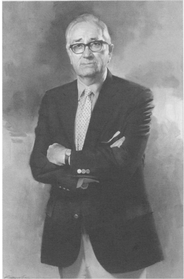
Virginia Historical Society