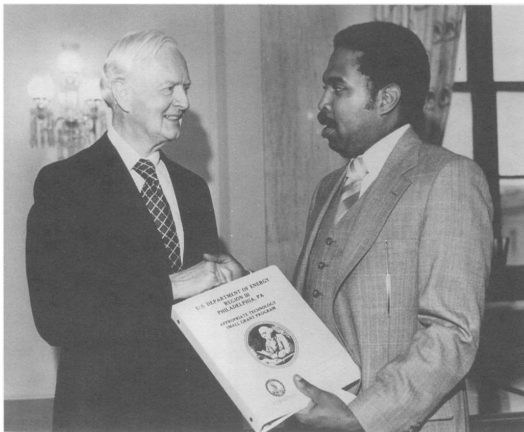
Harry F. Byrd, Jr., Papers (#10,320a-b), Special Collections Department, Manuscripts Division, University of Virginia Library