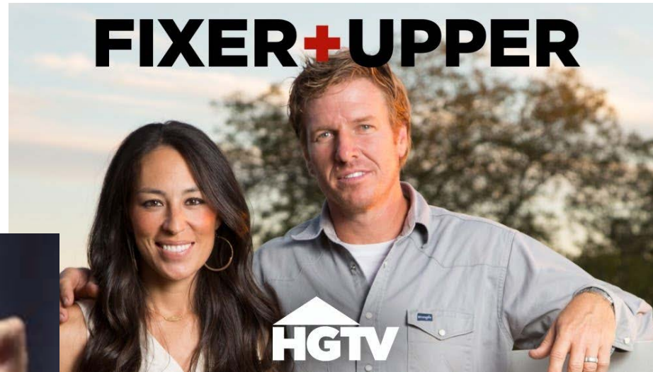
Joanna & Chip Gaines