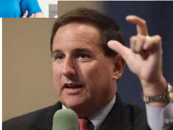
Mark Hurd, CEO Oracle