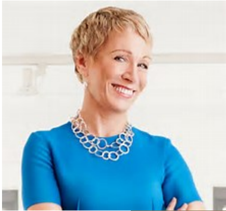
Barbara Corcoran Shark Tank