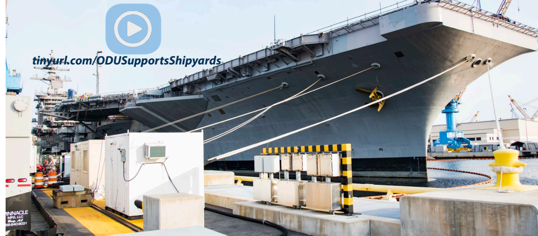
The aircraft carrier USS Dwight D. Eisenhower (CVN 69) is pierside in Norfolk Naval Shipyard preparing for a planned incremental availability.