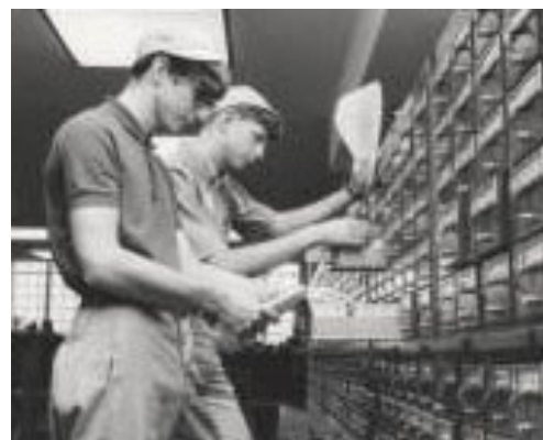
1968 Freshman Orientation to the Library

Check out all of our digital collections from the " Find Digital Collections " link on our website, http://www.odu.edu/library