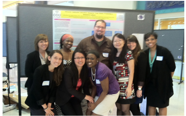
Students from the College of Education gather for a group picture.