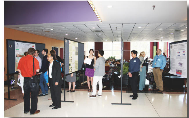
Students presenting their work during the Poster Presentation Session

The Office of Graduate Studies would like to thank all participating students for their dedication and hard work in making this year's Graduate Research Achievement Day a success.