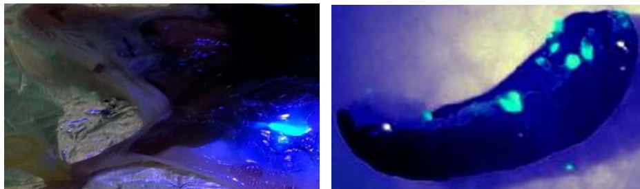
Tattooing effect on experimental mouse: Twenty-four hours after tattooing using blue fluorescent ink on the left shoulder of a mouse, its axillary lymph node, left, and spleen, right, were found loaded with blue fluorescent ink as seen under an ultraviolet light.

RESEARCHER TAKES MORE THAN SKIN-DEEP APPROACH TO STUDYING THE BODY-ART RAGE