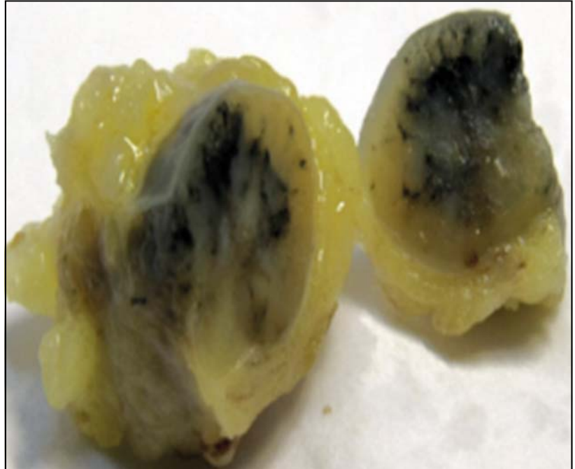
Human lymph node loaded with black Tattoo Ink]

And the process can be very expensive, painful, in some cases ineffective, and is not covered by insurance, he added.