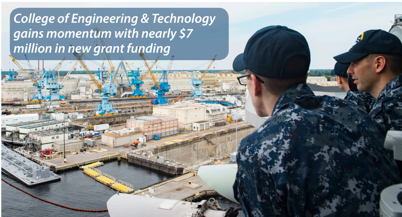
Sailors assigned to the aircraft carrier USS Dwight D. Eisenhower (CVN 69) observe as the ship pulls into Norfolk Naval Shipyard in Portsmouth, Va.

College of Engineering & Technology gains momentum with nearly $7 million in new grant funding