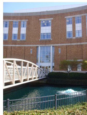
Visit the Distance Learning Center in the Albert Brooks Gornto Jr. Teletechnet Center

Look for more ODU Distance Learning marketing and a new website this spring and summer ( dl.odu.edu ).