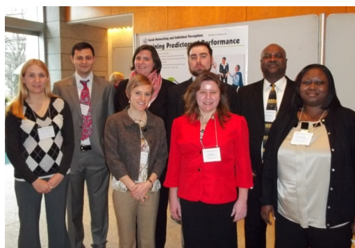
The eight ODU presenters at the Sixth Annual Graduate Student Research Forum at the Library of Virginia in Richmond, VA on February 3