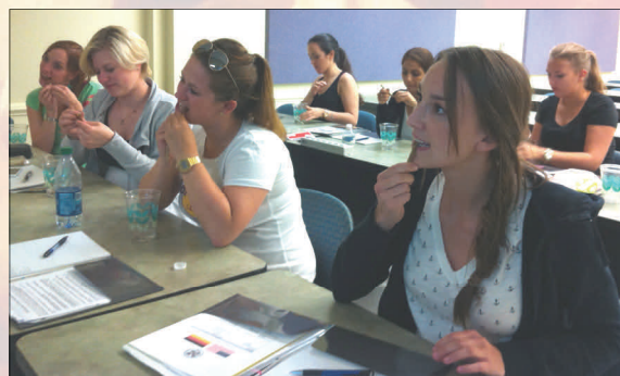
German Students Visit the School of Dental Hygiene