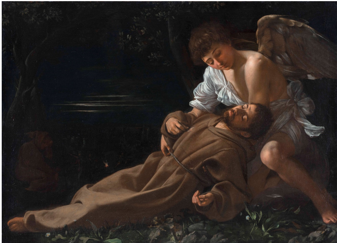
Figure 5. Michelangelo Merisi (Caravaggio), Saint Francis of Assisi in Ecstasy , c. 1594. Oil on canvas, 92.5 × 127.8 cm. Wadsworth Atheneum Museum, Hartford.

absent, and (3) the wounds in Saint Francis's hands and feet are also noticeably missing; only the wound in his side is visible. Pamela Askew suggests that it was only when the seraph disappeared that the wounds began to appear. 16 Bert Treffers, on the other hand, proposed that Caravaggio depicts the spiritual ecstasy after the stigmatization. 17 Stuart Lingo makes a compelling case supporting the subject of the painting as a stigmatization through the examination of Franciscan and Capuchin texts (Lingo 1998, pp. 186–222). He provides extensive textual evidence that explains the anomalies in Caravaggio's rendition of the stigmatization. Although I agree with Lingo's compelling reading, looking at the iconography through Franciscan devotion and affective chiaroscuro may reveal a more cohesive reading of Caravaggio's first sacred image.