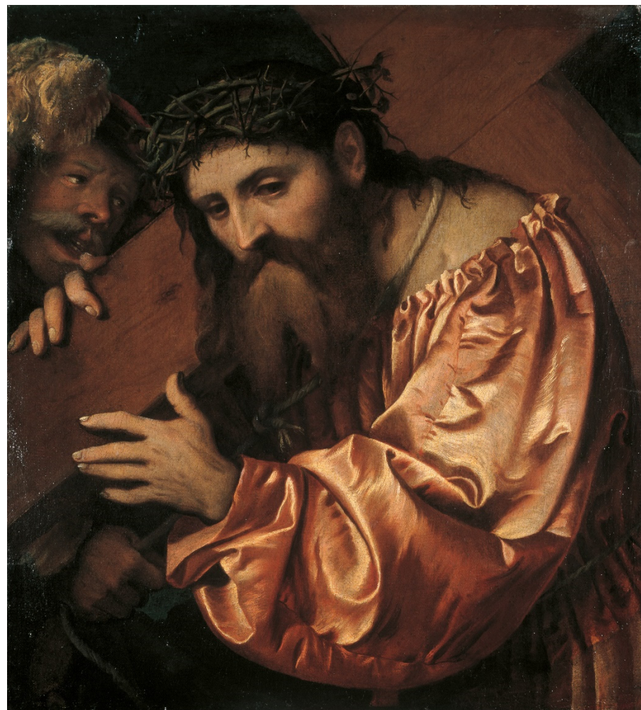
Figure 3. Girolamo Romanino, c. 1542. Oil on canvas, 81 × 72 cm. Pinacoteca di Brera, Milan.