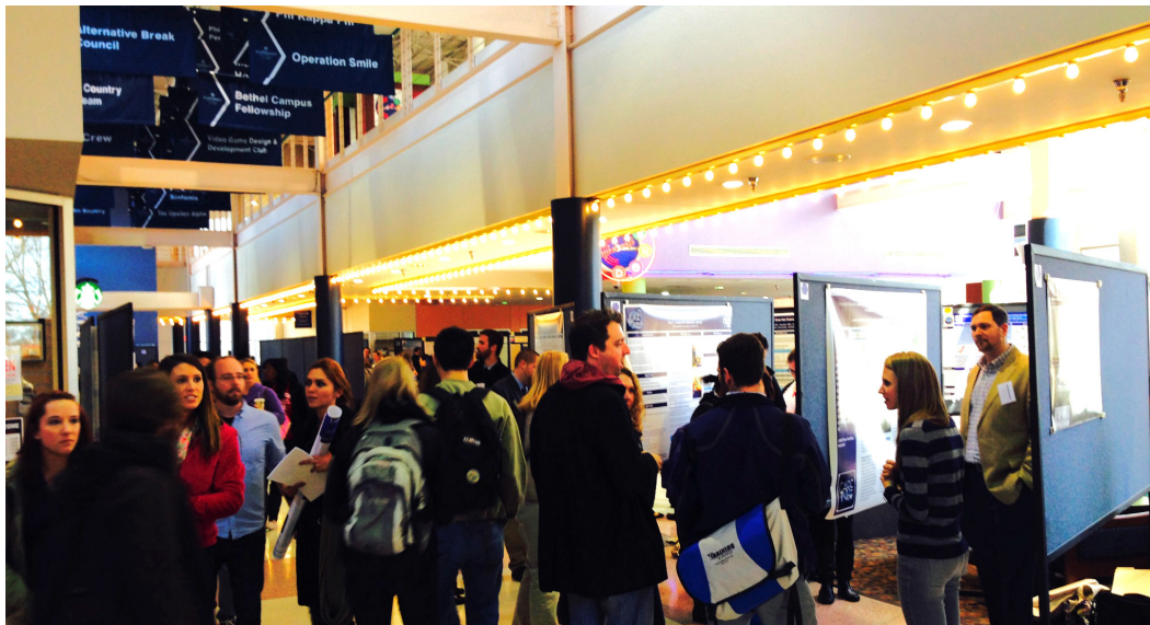
GRAD 2014 Poster Presentations