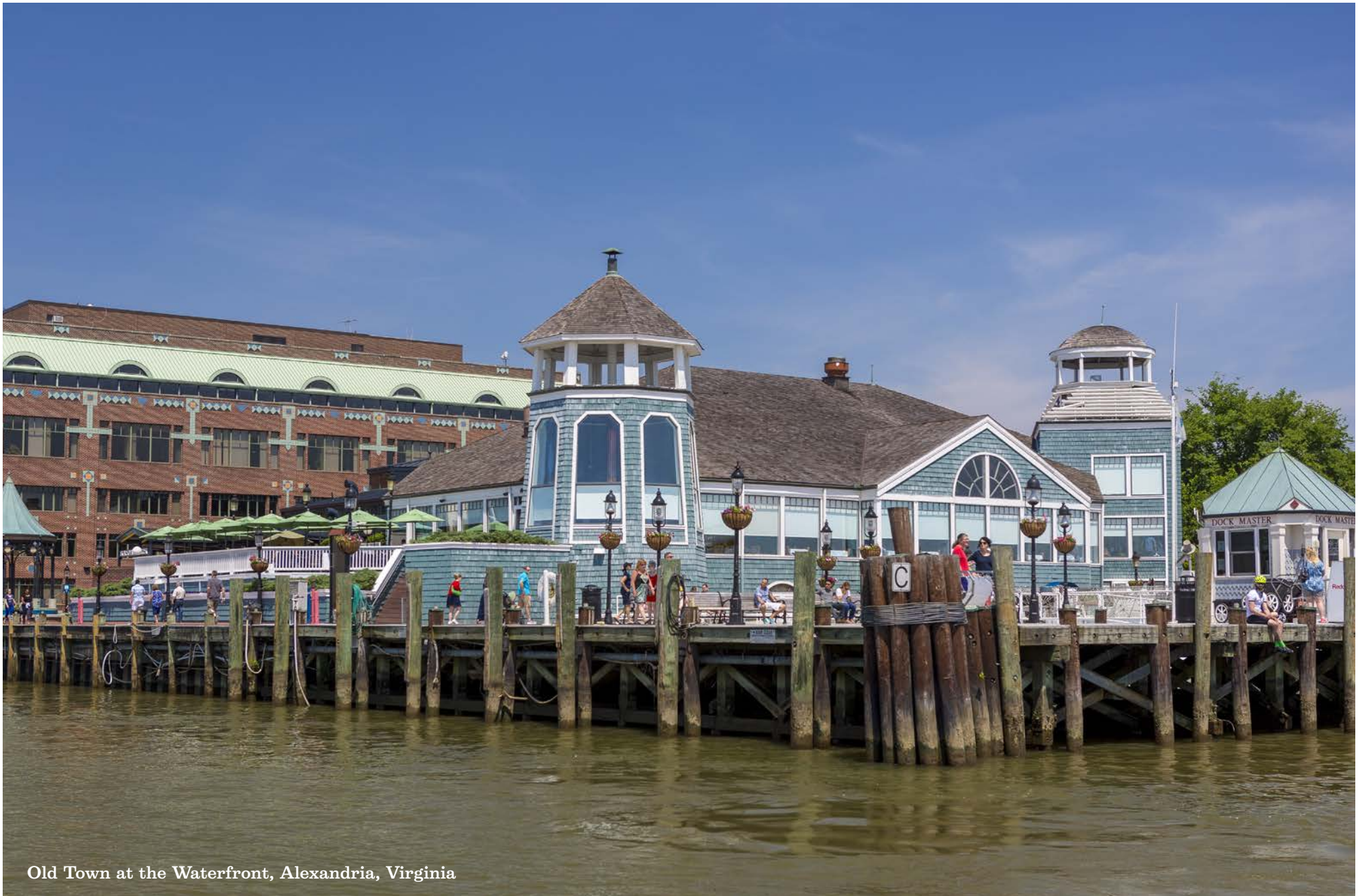
Old Town at the Waterfront, Alexandria, Virginia