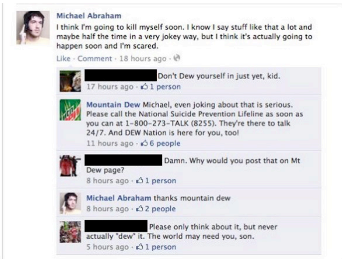
Figure 2: Suicidal note posted to Mountain Dew’s Facebook page [14].