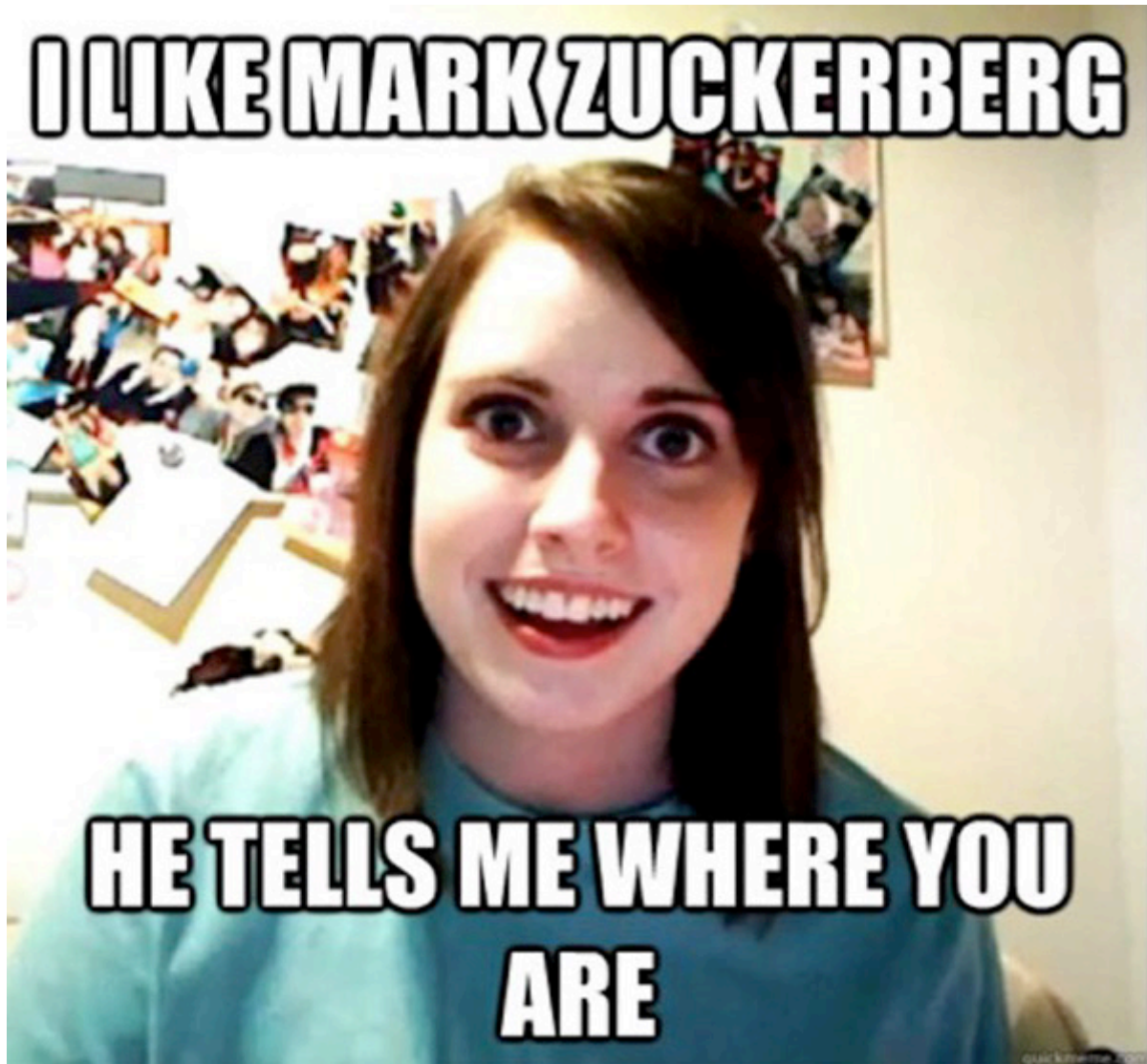
Figure 1: Instance of Overly Attached Girlfriend, original author Laina Morris [ 11 ].

note that the unilateral transfer of information may create an experience of intimacy, which the creeped-upon would prefer to be mutual and consensual rather than unilateral — if 'unilateral intimacy,' instead of being a sufficient condition for creepiness, is not simply a contradiction in terms.