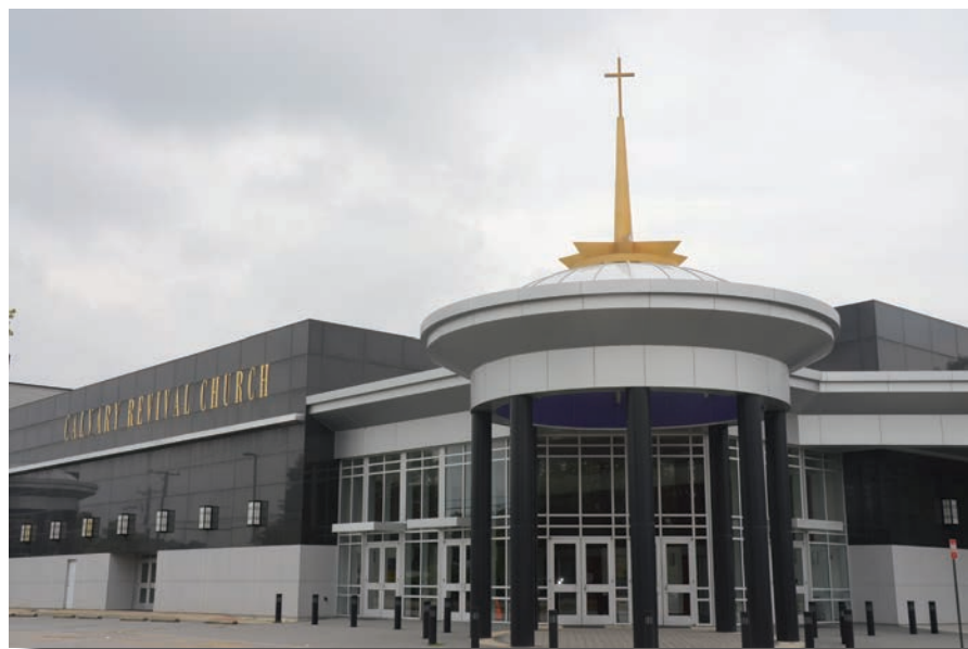
Calvary Revival Church, 5833 Poplar Hall Drive, Norfolk