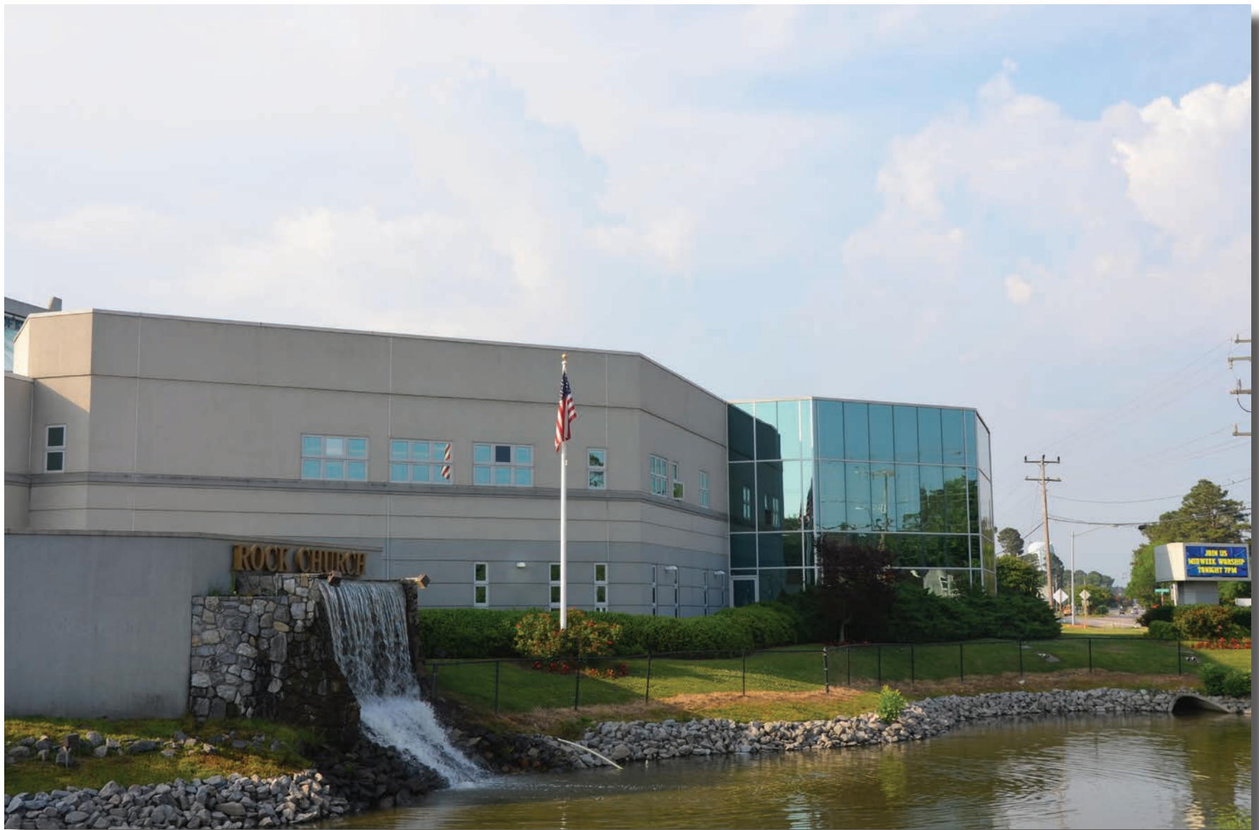
Rock Church International, 640 Kempsville Road, Virginia Beach