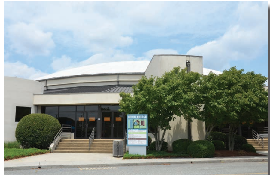
Bethel Church, 1705 Todds Lane, Hampton

In this chapter, we'll take a close look at some of the defining characteristics of U.S. megachurches. We'll see how the largest churches in Hampton Roads reflect these characteristics as well as how our region has provided fertile ground for very large churches to thrive. Hampton Roads' megachurches are as diverse as the region itself, and they have successfully appealed to congregants of many racial and ethnic backgrounds.