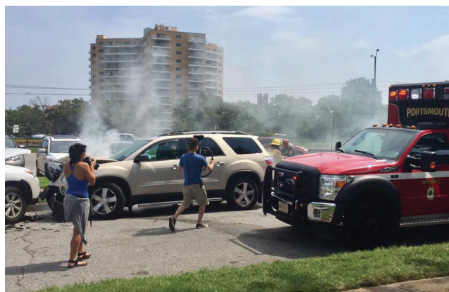
Above: Filming for a child safety intervention project