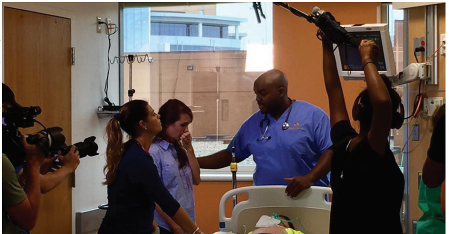
Above: Additional filming for a child safety intervention project