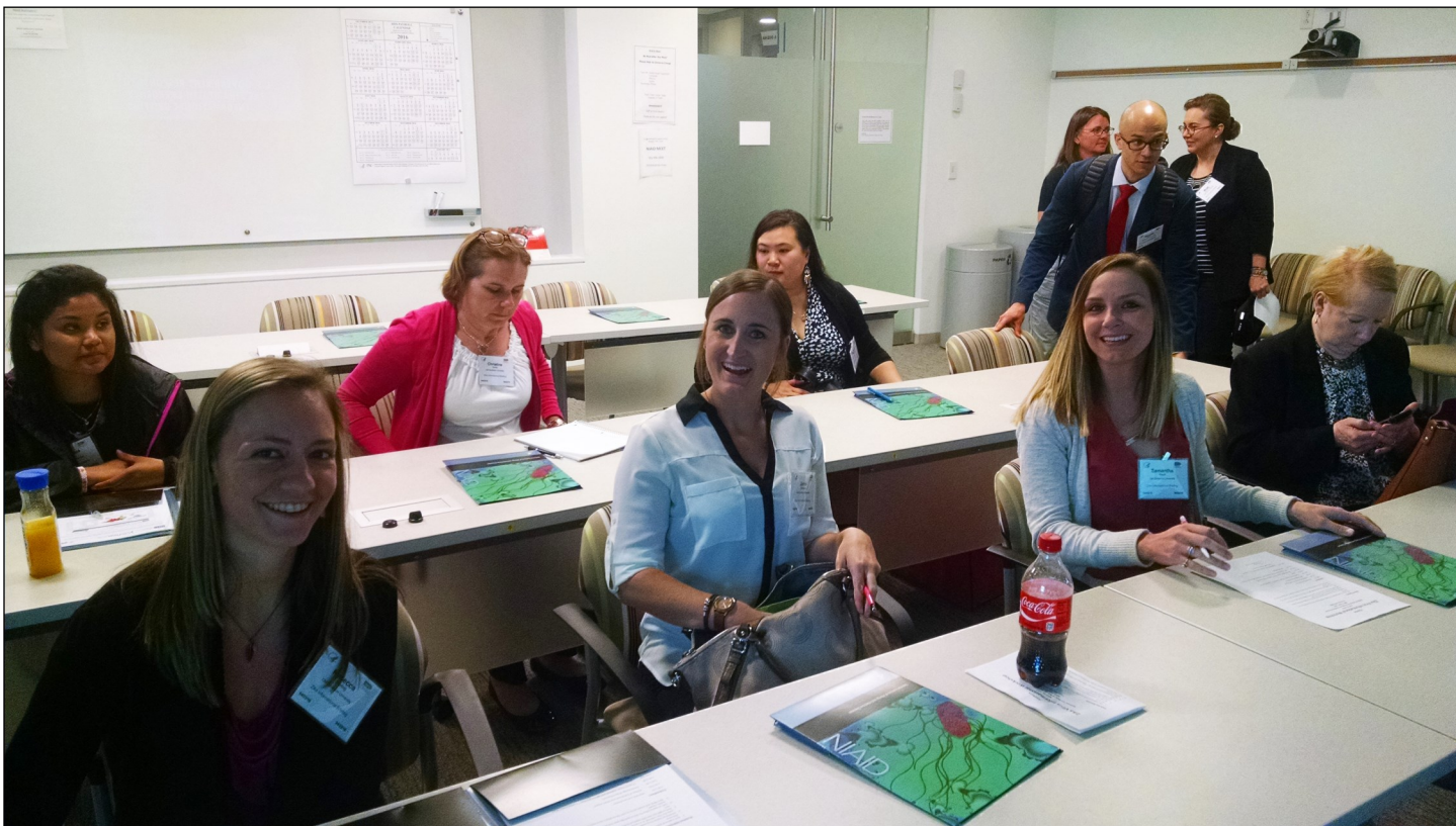
Old Dominion University students and faculty prepare for the workshop at NIAID headquarters in Rockville, Md.