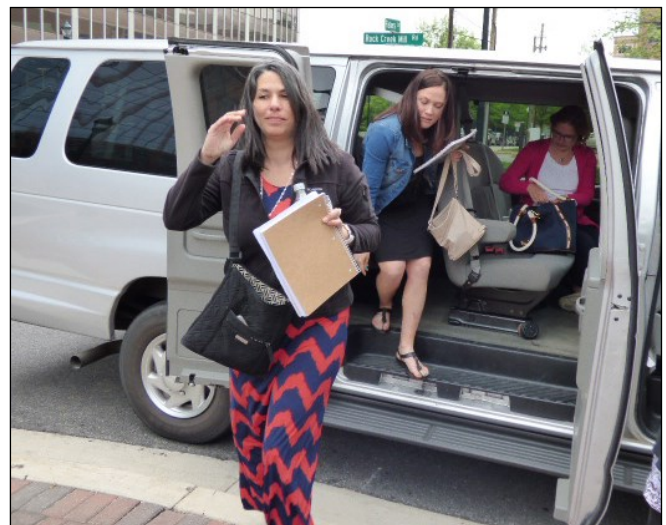
Students and faculty arrive at the National Institute of Allergy and Infectious Disease after an early morning van trip from the Old Dominion University campus.

The Center for Global Health, in collaboration with several schools and programs in the College of Health Sciences, had plans for an interprofessional group of faculty and students to travel to South America and the Caribbean this spring. But because of growing concerns regarding the Zika virus outbreak, the trip was scuttled, and with it study-abroad plans of students who would have had a chance to learn firsthand about health concepts in a developing country.