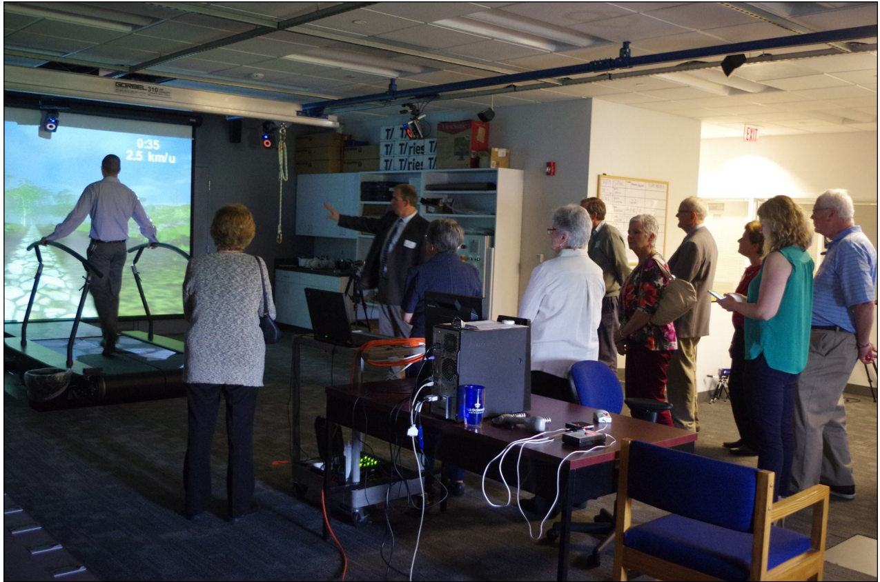
Members of the Golden Pride observe the treadmill simulation demonstration.