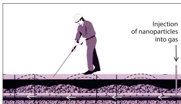
Fig. 2. An example of how method to determine location of polyethylene gas pipeline and places of possible illegal tapping of those pipeline can be performed

The invention refers to construction, gas pipeline transport in gas industry and can be used to determine position of polyethylene gas pipelines and places of possible illegal tapping of pipeline [7]. The essence of the invention is that natural gas is marked with ferrous particles pumped into distribution polyethylene pipeline prior to sector of possible illegal tapping (Fig. 2). Then subsurface