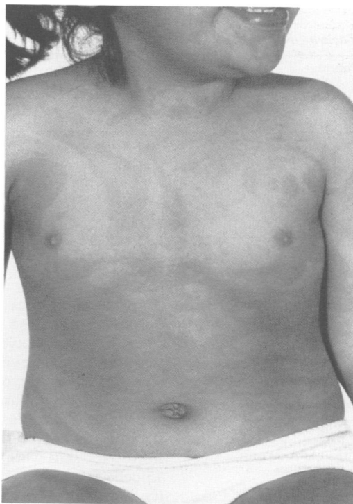
Figure 1 Hypopigmented streaks on the anterior trunk of case 1.

These fibroblast karyotypes are summarised in table 2.