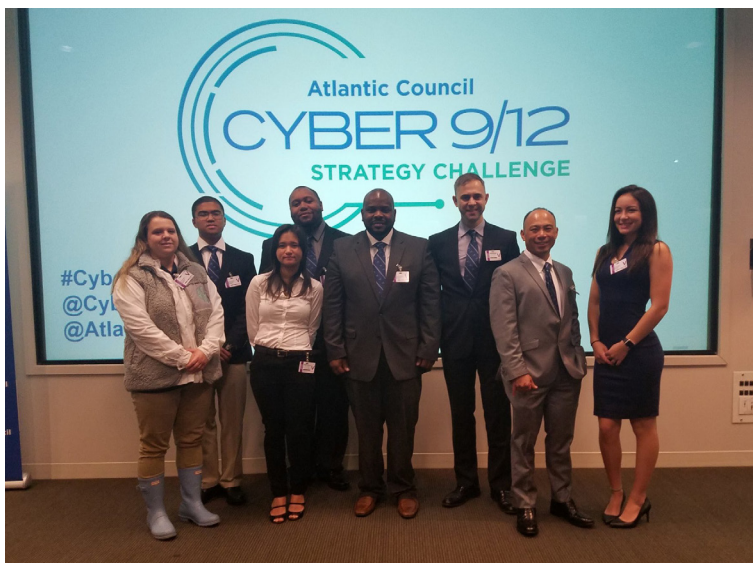
ODU Team in a prior Cyber 9/12 Challenge in DC.

More information about GPIS and CCSER can be found at https://www.odu.edu/gpis and https://www.odu.edu/ccser .