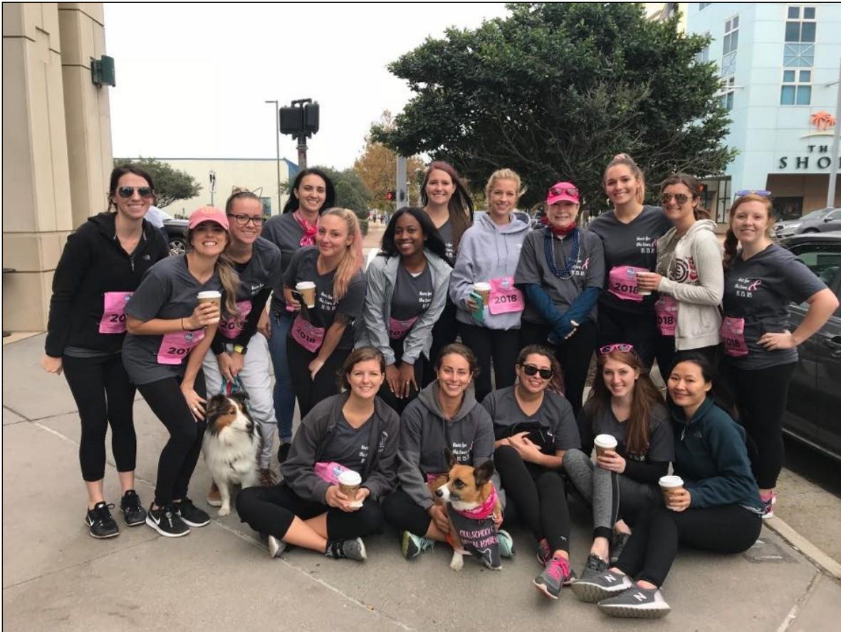
Photo from the 2018 Race for the Cure

The School of Dental Hygiene is inviting alumni to join its students, faculty and staff next month for the Susan G. Komen Race for the Cure in Virginia Beach.