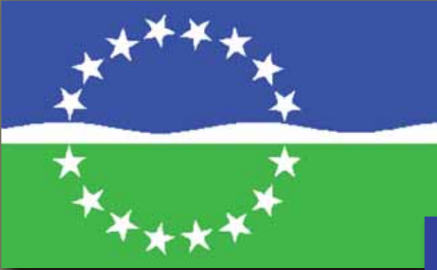
HAMPTON ROADS, VA