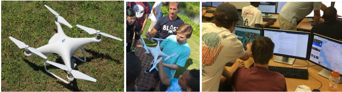
Figure 2: Hands-on session on the use of drones in geospatial technology to create a more accurate representation of flooding that happens due to the sea level rise

tasked with answering the fundamental question: How will flooding from sea level rise impact my community? They conduct the following four primary tasks as they work towards developing their answer: Task # 1: Planning to collect location information and pictures of buildings and areas impacted by flooding; Task # 2: Collecting simulated flood damage data using GPS, tablets, and digital cameras; Task # 3: Performing visual overlay, analysis, and synthesis of flood hazard data; and Task # 4: Communicating their findings by creating an interactive “live” Esri Story Map website.