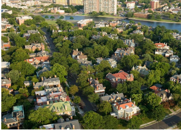
Figure 4: Story map describing sea level rise issues in The Hague neighborhood, Norfolk, VA

Ever since it was settled in the late 1800s, the Hague, located just North of Downtown Norfolk, has been a vibrant district with unique homes full of character, and art galleries with priceless artifacts. This low lying hemispheric peninsula is extremely close to sea level, and floods easily, even just with normal high tide. This is partially due to the warm water surrounding this area, which