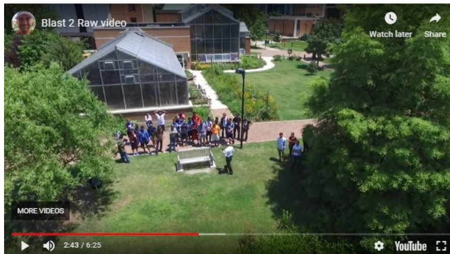
Figure 3: Drone raw video created by one group of participants in the Satellites, Lasers, and Drones session, uploaded to YouTube [41]

Students created videos with camera mounted on the drone, as can be seen in Figure 2.