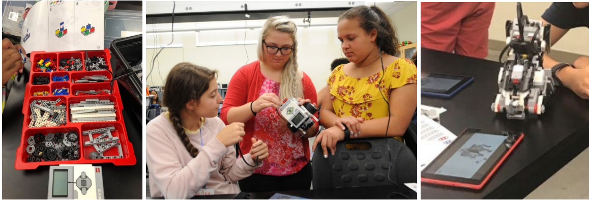
Figure 6: Graduate student teaching participants how to program LEGO Mindstorm robots.

design and constraints, students build, test, and revise their robots. Throughout the process, students are assisted by peer-mentors who are proficient with LEGO Mindstorms, as shown in Figure 6. Mentors were from middle school, high school, and from graduate programs.