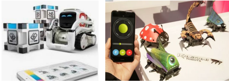
Figure 1: Cozmo robot [38] and Kamigami robots [37]