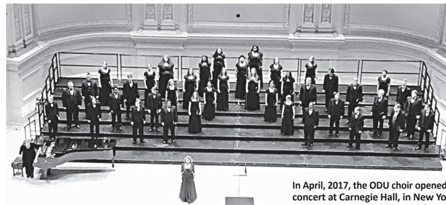
In April, 2017, the ODU choir opened a concert at Carnegie Hall, in New York City, with a special program of songs all related to the state of Virginia