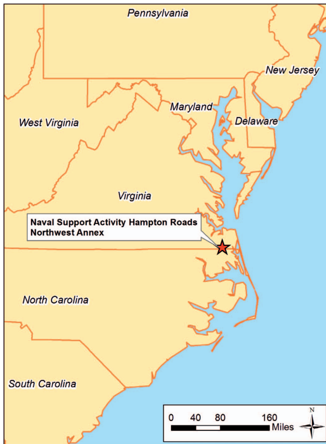
FIG. 1. Location of study site at Naval Support Activity Hampton Road, Northwest Annex in southeastern Virginia.

linensis ). To do so, we compared diet, determined through fecal analysis, to the frequency of ambush postures observed during the telemetric study of this population. In our study, a positive relationship between time spent in the vertical-tree ambush position and squirrel remains in snake feces would indicate squirrels are the target of the vertical-tree ambush position. Specifically, we assess the diet of our C. horridus population as it relates to foraging posture and relative prey abundance and biomass.