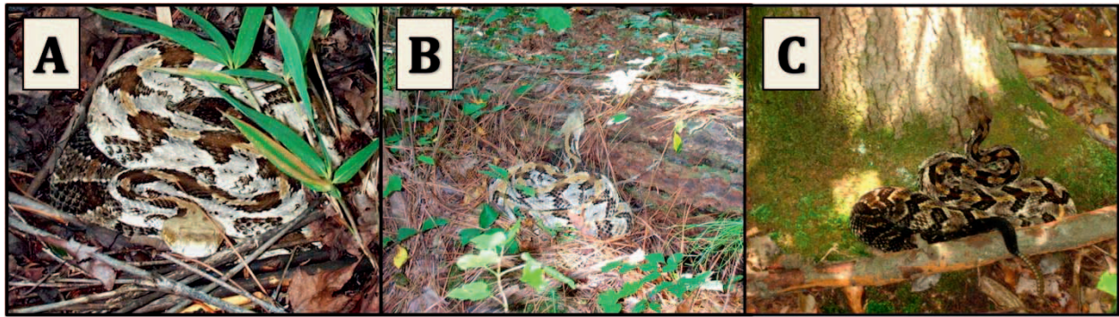
FIG. 2. Crotalus horridus ambush postures in Virginia; (A) non-log-oriented, (B) log-oriented, (C) vertical-tree.