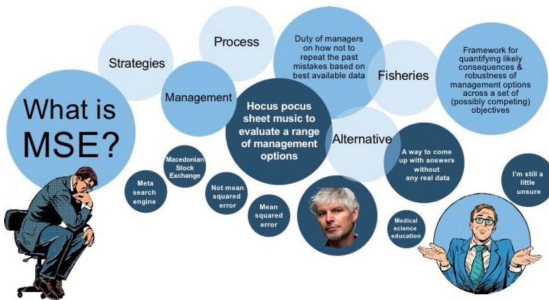
FIGURE 1. Infographic illustrating different perceptions of MSE development and implementation presented by André Punt (inset photograph). The three branches show the difficulty in MSE development and implementation for fisheries and the range of perceptions of MSEs, which include a science-based framework for fishery management (upper), confusion and uncertainty about MSEs (middle branch), and lack of understanding about MSEs and their application (lower branch). The infographic was created by Indi Hodgson-Johnson, University of Tasmania.