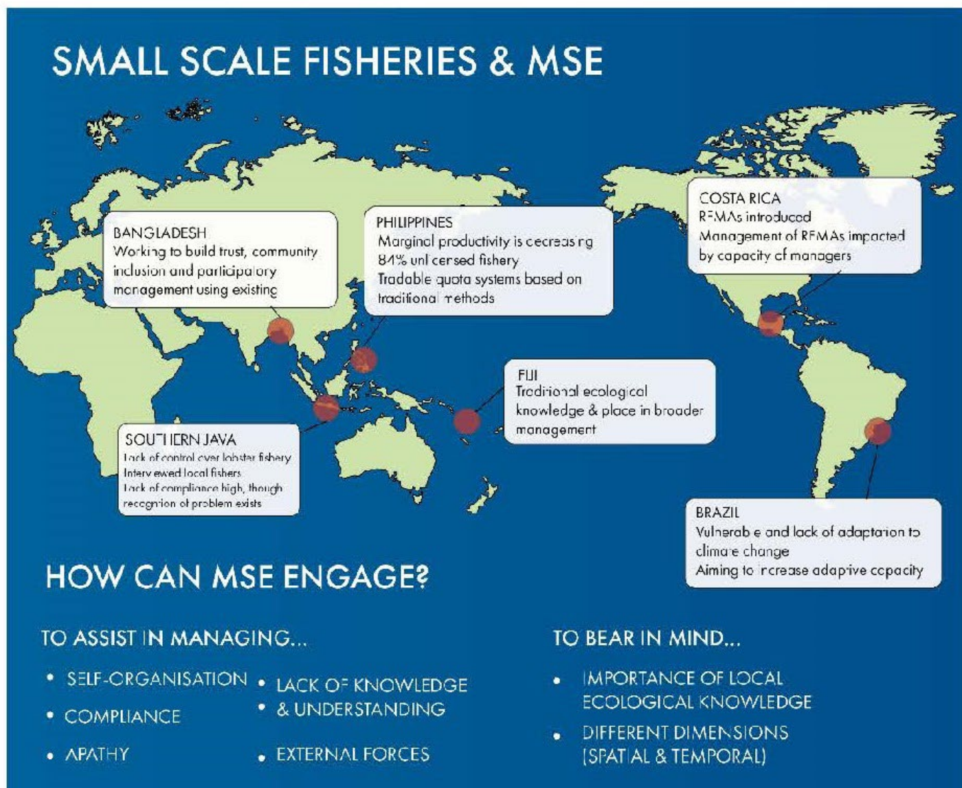
FIGURE 2. Infographic summarizing needs of small-scale fisheries and benefits of MSE model development for evaluation of management scenarios. The distribution of the small-scale fisheries discussed at the MSE workshop and their important characteristics are shown. Also shown are the approaches, issues and limitations of MSE engagement identified in discussions. The infographic was created by Indi Hodgson-Johnson, University of Tasmania.

options for fisheries. The middle branch depicts the perception that managers often have of MSE development and outcomes, which is characterized by confusion and uncertainty as to what an MSE is and how it is implemented to assess management options for fisheries. The lower branch suggests that the strengths of MSEs for evaluating management options are not understood or appreciated.