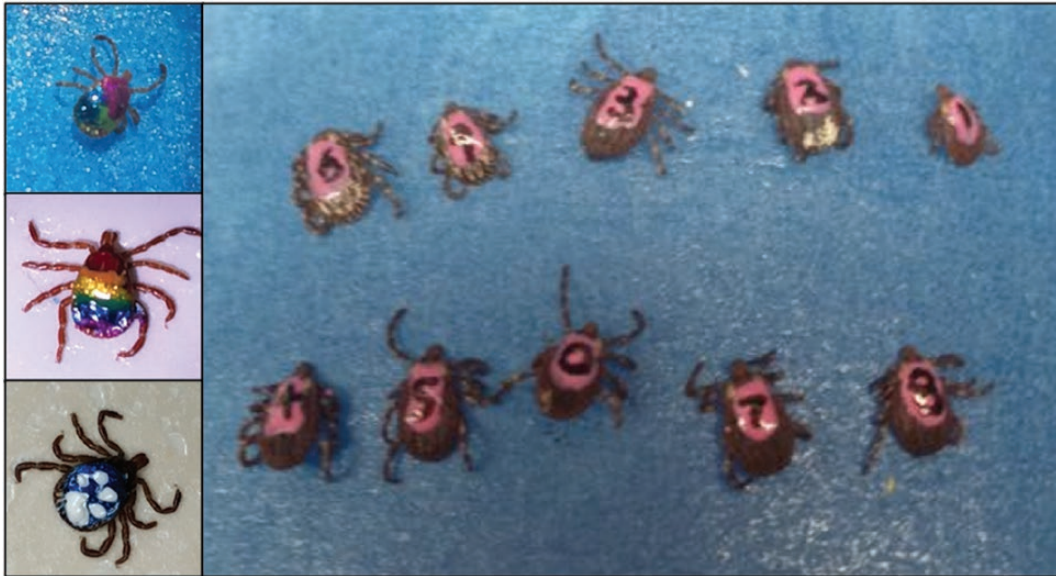
Fig. 3. Examples of painted ticks. Ticks can be painted with multiple colors to allow for notation of multiple recapture events. Ticks can also be marked as individuals using a fine-tipped marker over a light paint color.