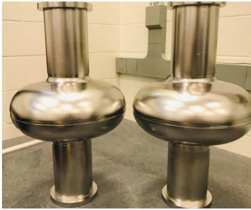
Figure 1: 1.3 GHz TESLA shaped single cell cavities fabricated with SRF grade Nb (left) and cold work Nb (right). Also shown is the cross-sectional EBSD-OI for respective sheet materials.

The cavity was again subjected to EP at temperature lower than 5 °C. The successive heat treatment of 900 and 1000 °C for 3 hours followed by 25 μm EP was done before each cavity test.