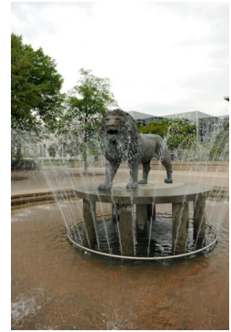
Visit the Career Management Center located on the second floor of the Webb Center, suite 2202

Don't forget to check out ODU's CareerLink ( odu.edu/ao/cmc/employment/erecruiting ). There are currently over 300 jobs available, ranging from Speech Language Pathologist to Financial Analyst.